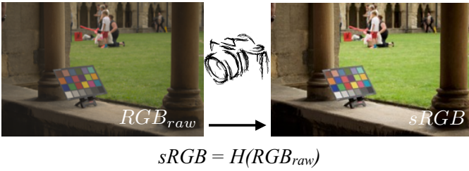
Fig. 2. Color correction (mapping raw to display sRGB) is an homography problem. This figure is also a color chart example which was used for our color correction evaluation.

RGI form between illuminants. Due to different shading, the RGI triple under a second light is represented as \underline{c}'^T = \alpha' \underline{c}^T H , where \alpha' denotes the unknown scaling. Without loss of generality let us interpret \underline{c} as a homogeneous coordinate i.e. assume its third component is 1. Then, [r' \ g']^T = H([r \ g]^T) (chromaticity coordinates are a homography H() apart). ■